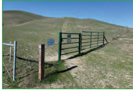
Looking up towards the Dougherty Valley Ridge Trail from the Rancho San Ramon Park Access Point