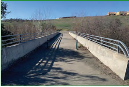
Old Dougherty Road Access Point